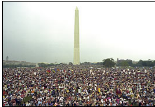
Rally at Washington Monument

To date this was the greatest religious rally ever assembled in Washington, D.C. An estimated 300,000 people of all creeds and colors came to hear him speak at the "God Bless America Festival" on September 18, 1976. At this historic rally, Reverend Moon called upon America to fulfill its blessing as one nation under God, and to create "one world under God." He referred to himself as a "doctor" or a "fire fighter" from the outside who has come to help America meet its third great "test" as a nation, that of "God-denying" communism, and to revive its religious heritage. He proclaimed that the Unification Church with its "absolutely God-centered ideology" had the "power to awaken America, and raise up the model of the ideal nation upon this land."