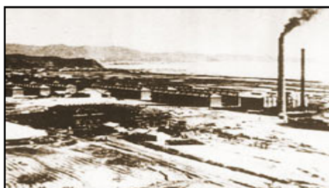
Hungnam prison camp

Charged with disturbing the social order, in November 1946, the young minister was imprisoned and tortured. The police believed him to be dead and tossed his body into the prison yard. Some of his followers found him and carried him away to tend to his broken body. Miraculously, Reverend Moon survived and regained his strength. Undaunted, he began preaching in public once again.