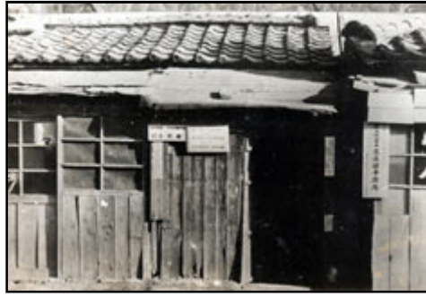
Church in Seoul

On May 1, 1954, in Seoul, Reverend Moon founded the Holy Spirit Association for the Unification of World Christianity, Rev. Moon's faith community which became popularly called the "Unification Church" worldwide.