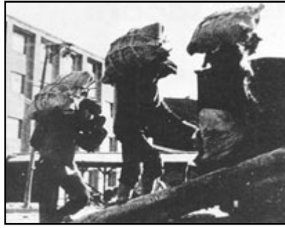
Labor at death camp

In April 1948, he was arrested a second time and sentenced to five years of hard labor in Hungnam prison. He was among the first of the Christian ministers sent to the Soviet-style North Korean gulag. Hungnam was an extermination camp where prisoners were deliberately worked to death. Few lasted more than six months. Yet in that horrific concentration camp, Reverend Moon survived for nearly three years. Although he did not speak a word of the Divine Principle, many of his fellow prisoners looked to him for spiritual strength and became his disciples.