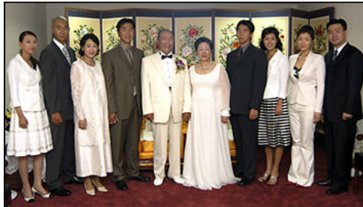
Rev. Moon's children completed 120 country speaking tour