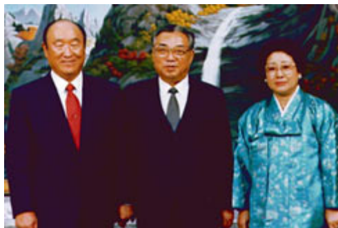
Rev. and Mrs. Moon with with Kim Il Sung