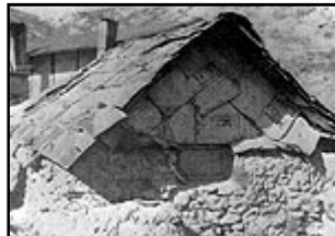
The first church (Pusan)

As a one of hundreds of thousands of war refugees, Reverend Moon arrived in the southern port city of Pusan, where he and one disciple built the first Unification Church from discarded army ration boxes. At that time, he told his small following that one day the message of the Divine Principle would be spread all over the world. He prophesied that people from all over the world would venerate that hillside. Reverend Moon's prophecies sounded unbelievable. Today, in fact, tens of thousands of people make a pilgrimage to the spot.