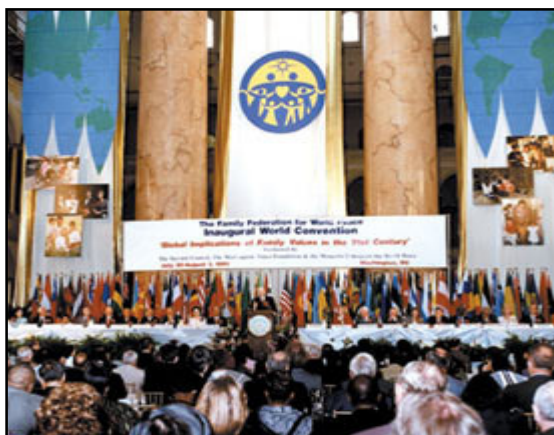
Keynote address at FFWP inauguration

In 1996, Reverend Moon announces the end of the era of the Holy Spirit Association for the Unification of World Christianity and the Unification Church. In its place, he founds the Family Federation for World Peace and Unification, building a network of families from every race, religion and culture, united in the belief that centered on God's love, happy marriage and successful families are the cornerstone to solving the most fundamental problems of society.