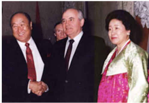
Rev. and Mrs. Moon with President Gorbachev

In 1990, Reverend Moon organized a major conference of media leaders and former heads of state in Moscow. This fulfilled a pledge he had made in 1976 that one day he would organize a "great rally for God in Moscow." During this conference, Reverend and Mrs. Moon met with Soviet President Mikhail Gorbachev. Through several interviews, televised and in print, he gave a message of hope to the Soviet people, urging them to turn toward God. A strong opponent of communism, Reverend Moon taught that the ideology was mistaken but he came to love the communist people. Since the fall of the Soviet Empire he has funded numerous activities to assist former communist countries in their transition to democracy and freedom.