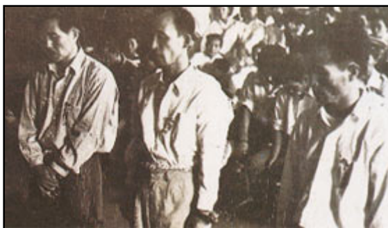
Rev. Moon at North Korean court

He began to teach publicly, despite the dangers presented by the communist-dominated government. As a poor preacher with new interpretations of the Bible, Reverend Moon was more vulnerable than leaders of the established churches and was, therefore, one of the first religious figures to be imprisoned by the communists.