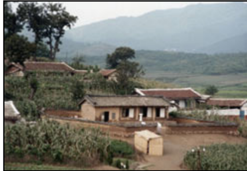
The house Rev. Moon was born at (North Korea)

Sun Myung Moon was born on January 6, 1920, into a family of farmers that had tilled the land for centuries. As a boy he studied at a Confucian school and was a keen observer of the natural world. Around 1930, his parents became fervent Christians--Presbyterians--and the young Sun Myung Moon became a Sunday school teacher.